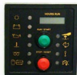
Standard: remote start