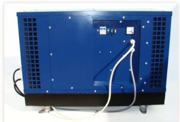
Standard: built in fuel tank